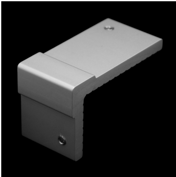
(shown in Clear Anodize)

This product is not intended for use on steps, stairs, sidewalk curb, or any pedestrian trafficked surfaces.