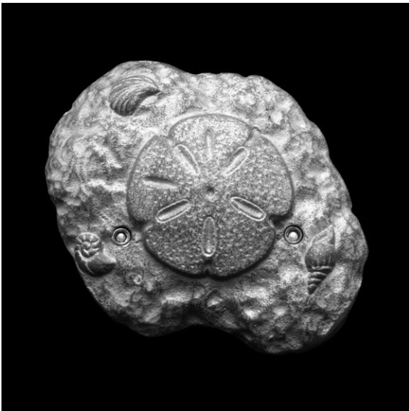
(shown in Cast Aluminum)

Description: The Sea Life family consists of 5 different sea life parts rendered at realistic scale and incredible detail. The parts use two SMART PINS PLUS anchors.