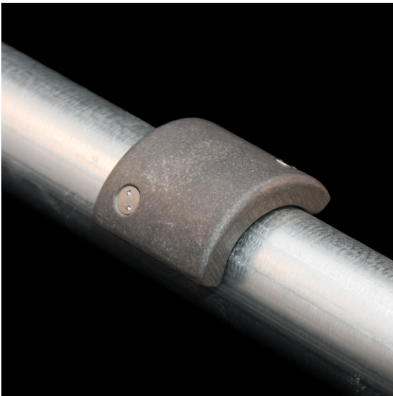
(shown in Cast Aluminum)

Description: The patented cast parts are designed for round, tubular handrails. The part is attached with two stainless steel tamper resistant screws and two-part epoxy.