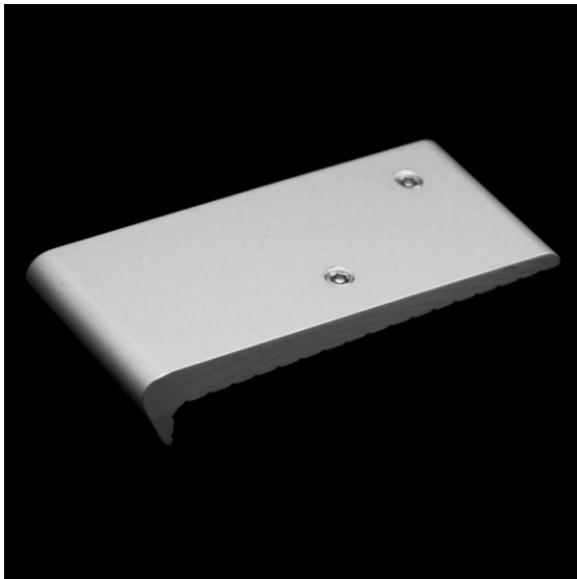
(shown in Clear Anodize)

This product is not intended for use on steps, stairs, sidewalk curb, or any pedestrian trafficked surfaces.