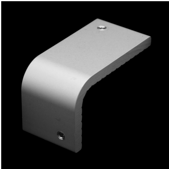
(shown in Clear Anodize)

This product is not intended for use on steps, stairs, sidewalk curb, or any pedestrian trafficked surfaces.